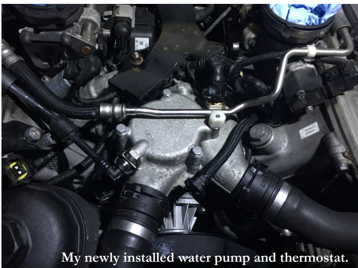
My newly installed water pump and thermostat.

There's nothing like coming home to a set of brand new wheels.