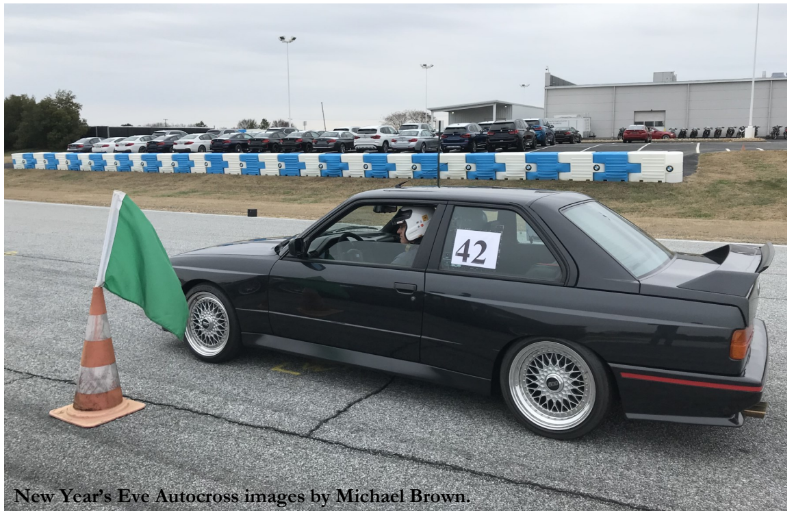
New Year's Eve Autocross