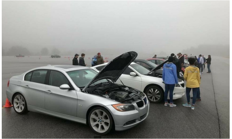
The day started off a little foggy, but ended up great.

The Sandlapper Chapter conducted our first of 2018 Street Survival program February 10 at the Michelin Laurens Proving Ground. If you are not familiar with Street Survival, it is a program to educate teen drivers and provide them actual experience in car handling at the limit. Essentially, we provide a safe environment to practice maneuvers they only see a slide of in drivers ed: a wet skid pad, braking while turning, emergency lane change, and handling courses. The day is divided between classroom and on track activities.