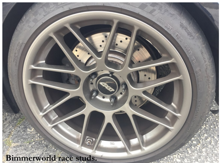
Bimmerworld race studs.