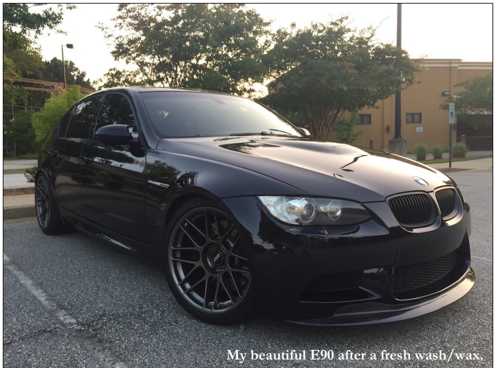
My beautiful E90 after a fresh wash/wax.